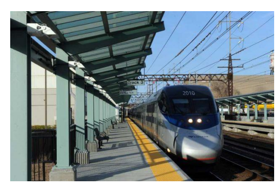
Amtrak Acela - High-Speed Rail in the US

There have been several recent studies offering different visions for Cascadia, and how highspeed rail can help to fuse the Pacific Northwest into an integrated economic powerhouse.<sup>i</sup> Common to these analyses is the recognition that fast, frequent transportation between Cascadia's hubs is essential, particularly for a regional economy increasingly focused on