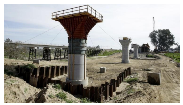
Delayed Construction of California's High-Speed Rail

relatively short 140 miles spanning Seattle and Vancouver. For planning purposes, it is better to err on the conservative given the many unknowns about route, time-frame, and technology. Based on data from the California high-speed rail system