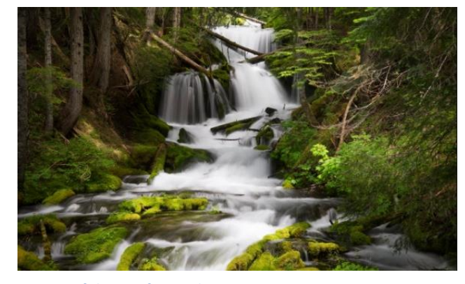
Forests of the Pacific Northwest

With economic integration – and the significant associated increase in economic, cultural, and business collaboration across the region – Cascadia can fit this mold for economic success catalyzed by seamless and fast transportation options. Population and employment are growing at high rates in both cities. Metro Vancouver expects the