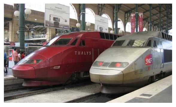
High-Speed Trains in Paris-Gare de Lyon

Trip Time: Express downtown-todowntown service would take less than one hour, which is achievable today for trains operating in excess of 200 mph. The train would also likely serve Everett and Bellingham.