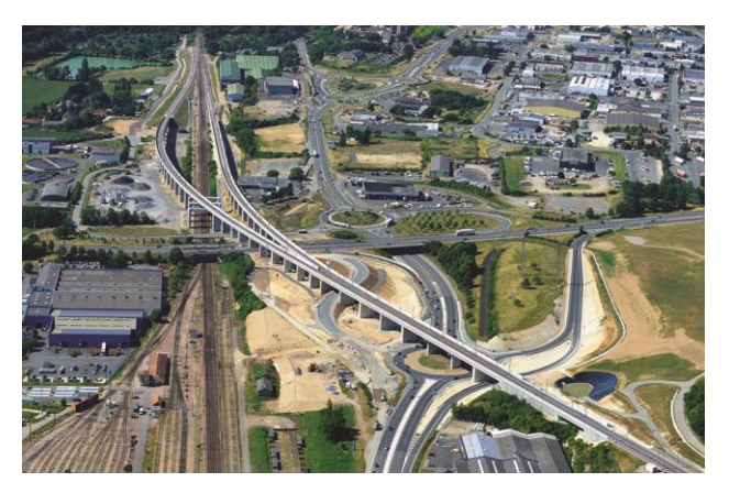
High-Speed Rail through Tours, France

In Lille and Tours, France, each about an hour or less from Paris on the TGV high-speed train, the number of daily trips to and from Paris has increased dramatically. Where business